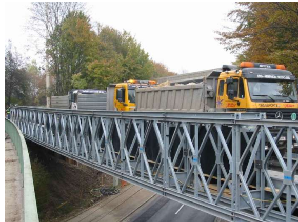
WB Panel Bridge

With a history going back to 1854, Waagner-Biro Stahlbau is a successful international group specializing in the fields of bridge construction, steel and mechanical engineering . Some 10,000 reference installations around the world testify to Waagner-Biro's comprehensive capability to perform the complete range of services for steel bridge superstructures, including design, engineering, fabrication, supply, erection, supervision, inspection, maintenance and rehabilitation.